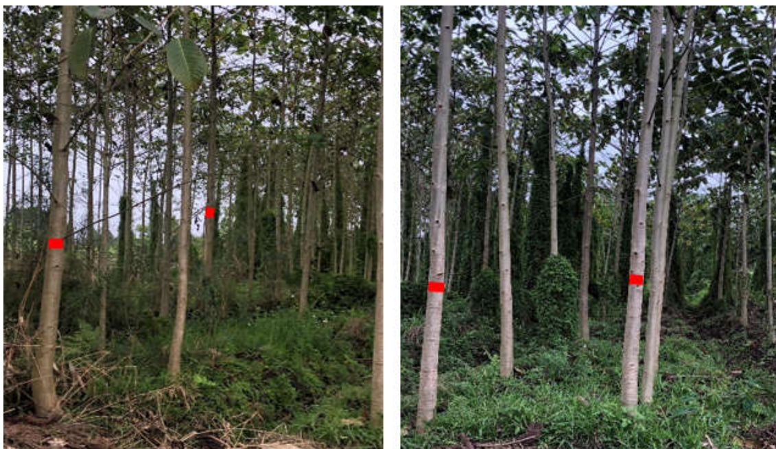
Figure 3. Plus trees and forests trees groups of the Gao vang plantation

Furthermore, photos (Figure 3) of the plus trees and the accompanying forest tree groups at the research scene partly shed light on what had been analyzed and commented on in the above sections.