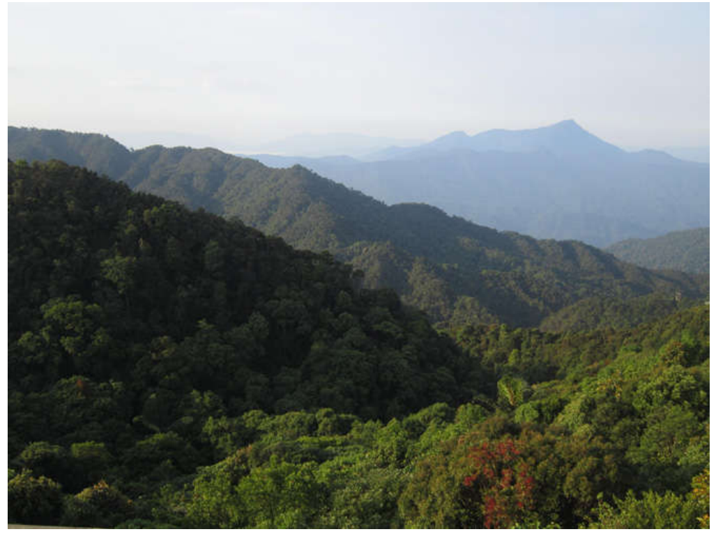
Figure 2. Mountain forest of Bach Ma, Thua Thien Hue where Teinopalpus aureus flies