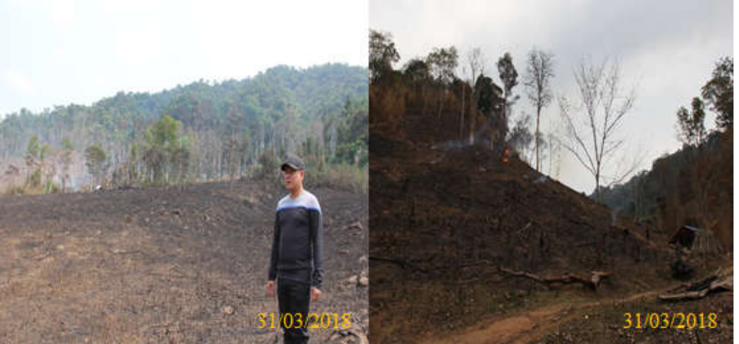
Figure 3. Photos from Field Visits - Uncontrolled forest fires

Fire was mentioned on several occasions as a factor affecting the quality of the forest in the NKD-NPA. Fires were reported to always be surface fires rather than crown fires. In this regard, this driver can be considered primarily one of degradation, however the long-term degradation of mature forests whose saplings have high fire-driven mortality rates and are quickly out-competed by sapling, seedling can lead to the eventual re-classification of forest from high to low density mixed deciduous forest, until density drops to below the UNFCCC definition of forest cover. By the survey and groups local people discussion, the main ways fire affect the NKD-NPA are the following: (1) Fires are used to prepare agricultural lands for the new planting season. This most often happens during the late months of the dry season (March - May). Windy conditions or poor fire management often cause fires to spread beyond the field boundaries into surrounding fields or forest nearby; (2). Hunters use fire to force animal movement in certain directions and to improve visibility in the forest. There is little incentive for hunters to practice fire management techniques and therefore these fires often burn out of control.